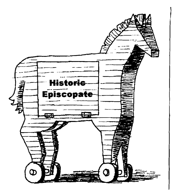
What we were told: Only a rite No real change